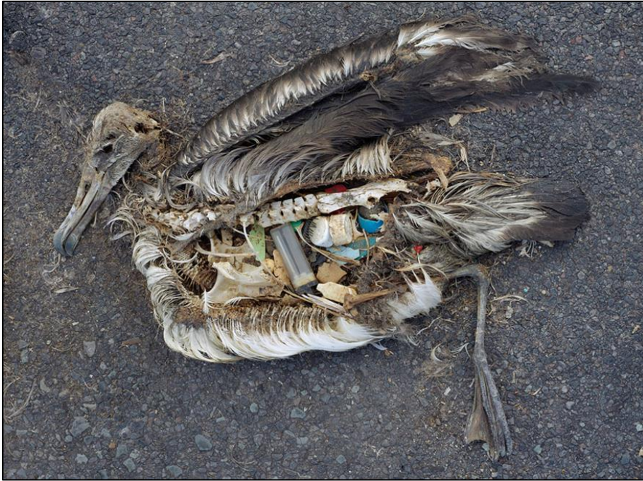
Figure 1: Picture of the Midway Albatross